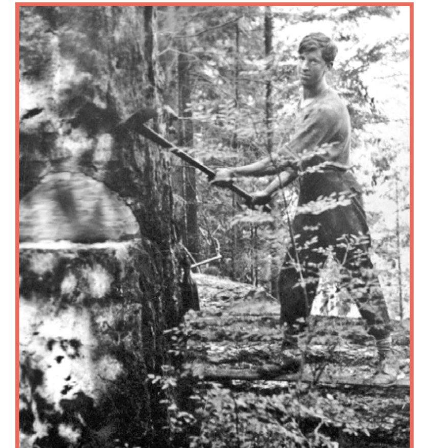
When you hike a Bowen trail, be on the lookout for large flat-topped stumps with deep oblong notches. These are the remains of trees logged by hand in the 1920s.

Bowen Island is a Municipality within the Islands Trust and has a mandate to: